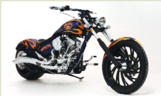
DAYTONA RAFFLE BIKE

DONNY'S TECHLINE: AIR CLEANERS & POWER III