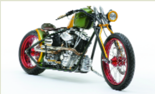
NYC CHOPPERS SHOVEL

DAYTONA GIVEAWAY BIKE: FINISHING THE BBC BUILD